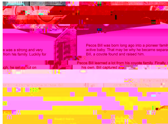
Figure 5. Sample silent reading fluency / comprehension passage for CMARS.

Procedures. For this subtest, the computer will announce that it is time to read a passage and answer questions (see Figure 5). Students will be told that the computer is timing them as they read the passage, but that they need to read the passage carefully enough to understand the passage without returning to the text. Timing will begin when the passage appears on the page and will end when the student turns the page to begin answering comprehension questions regarding the content of the passage.