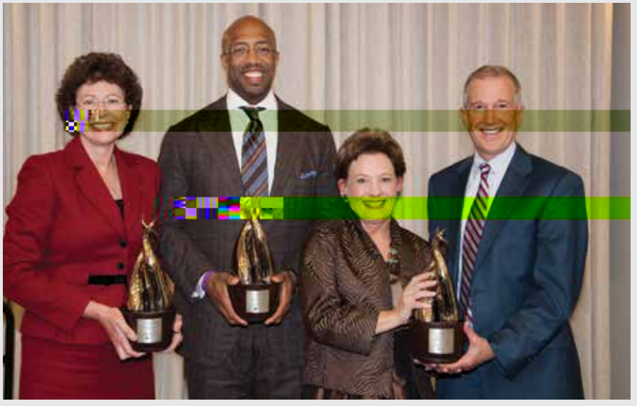
A ... -K ... 2015 L ... T ... P ... I ... ( ) ... B ... B ... S ... M ... S ... P ... Q ... C ... D ... G ... K ... J ... B ... L ... C ... D ... L ... S ... R ... H ... C ... D